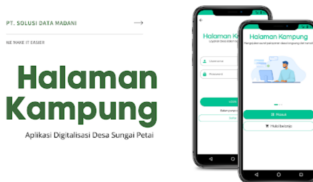
Figure 1.1 Village Page Application

Figure 1.1 explains that Sungai Petai Village, Kampar Kiri Hilir District, Kampar Regency has a village digitization application called HALAMAN KAMPUNG, Kampung Page is a mobile application that is used for various administrative services in the village. The Kampung Page application is the first innovation of mobile-based village government services in Riau, this application is expected to help village officials and the