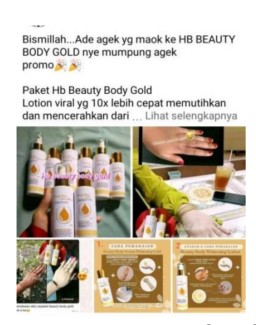
Image of online buying and selling transactions via social media using the Facebook application

Based on the picture above, it proves that there has been social change in the Mensere Village community. This change is a change in buying and selling transactions between sellers and buyers which are no longer carried out face to face. However, the transaction process can be done online on social media via the Facebook application. Applications or social media are one of the influences on technological developments as a result of change. One of the influences of