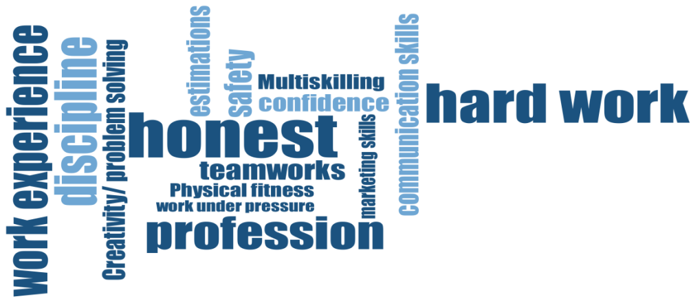
Figure 2: Soft competences as ranked by stakeholders