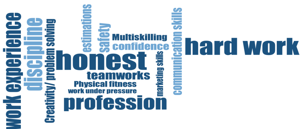
Figure 2: Soft competences as ranked by stakeholders